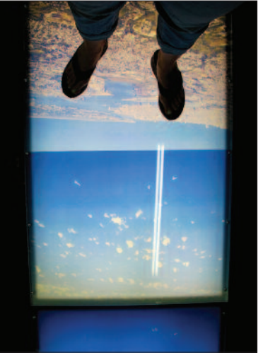
Sandra Ramos, 90 Miles , 2011, aluminum and digital prints on light boxes, 32' x 3' 4" x 2' 3", installation view. Dot Fiftyone.