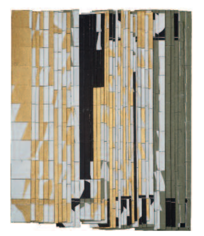
Shaun O'Dell, feelings.oxbowCollapse.gold , 2011, gouache on collaged paper, 10½" x 8½" x ½". Inman.

Works on paper filled an adjoining gallery, among them luminous abstract collaged-paper drawings that the artist created by cutting up and reorganizing "finished" works, using a process similar to musical improvisation (O'Dell is also a jazz saxophonist). In these and other gouache-and-collage pieces, the artist's delicate linear configurations and repetitive checkerboard-like patterns—executed mostly in deep blues, rich greens, and bright golds and reds—bring to mind