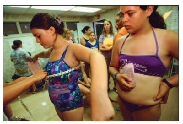
Lauren Greenfield, Camp Shane , 2001, Cibachrome print, 16" x 20". Annenberg Space for Photography.