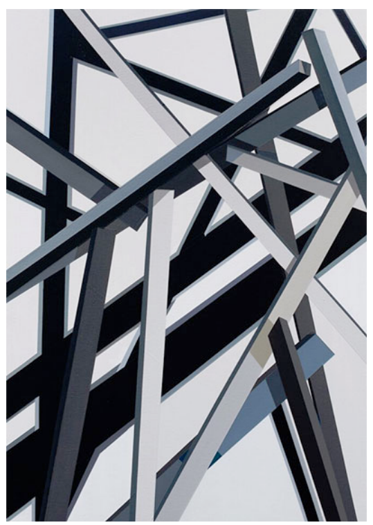
Tommy Fitzpatrick, Crow's \ Feet, 2015 acrylic on canvas 31 x 24 inches