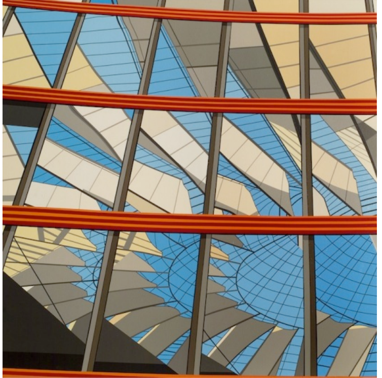
Sol Invictus, 2010 | Acrylic on canvas, 50 x 50 inches

I try to depict the skin of architecture as flat as possible with the use of acrylic paint and tape. Using this modernist hard edge language, I simulate illusionist space describes in the flattest of means. My paintings are complexity coupled with distortion. I want to present a clear but confusing image of the present – a type of crisis of perception.