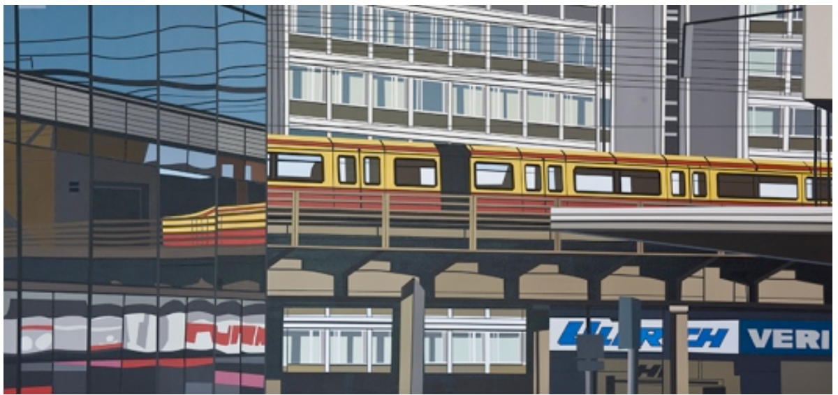
Above Ground, 2010 | Acrylic on canvas, 33 x 69 inches

TF: I think of the painting process as if it were a job. I work everyday and enjoy the early mornings the best. Music is a big part of the painting experience. I usually work on paintings one at a time and spend close to a month on each one.