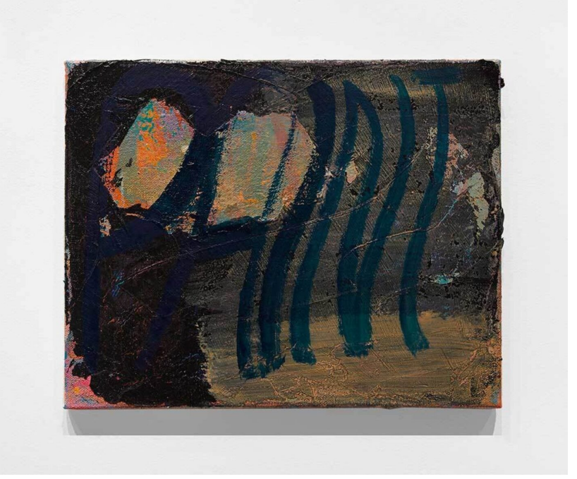
Dana Frankfort, Paint , 2022, oil on burlap, 16 \times 20 inches.

DF: At that time that word felt complicated but also funny, and it doesn't have any of that for me anymore. Now overlooked words like And and Paint feel the most complex.