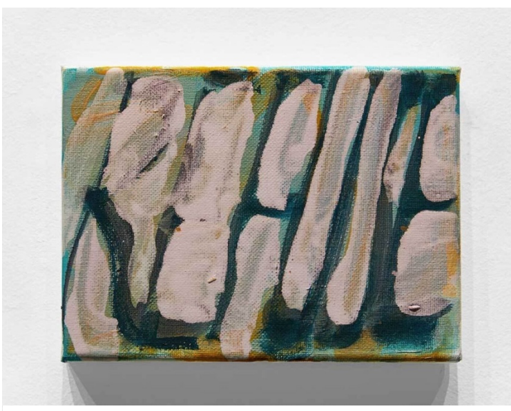
Dana Frankfort, Refuse , 2022, oil on canvas, 5 \times 7 inches.

MO: I know you've talked about growing up in the '80s in Houston and the palette of those decades influencing your paintings, but these new paintings feel muddier.