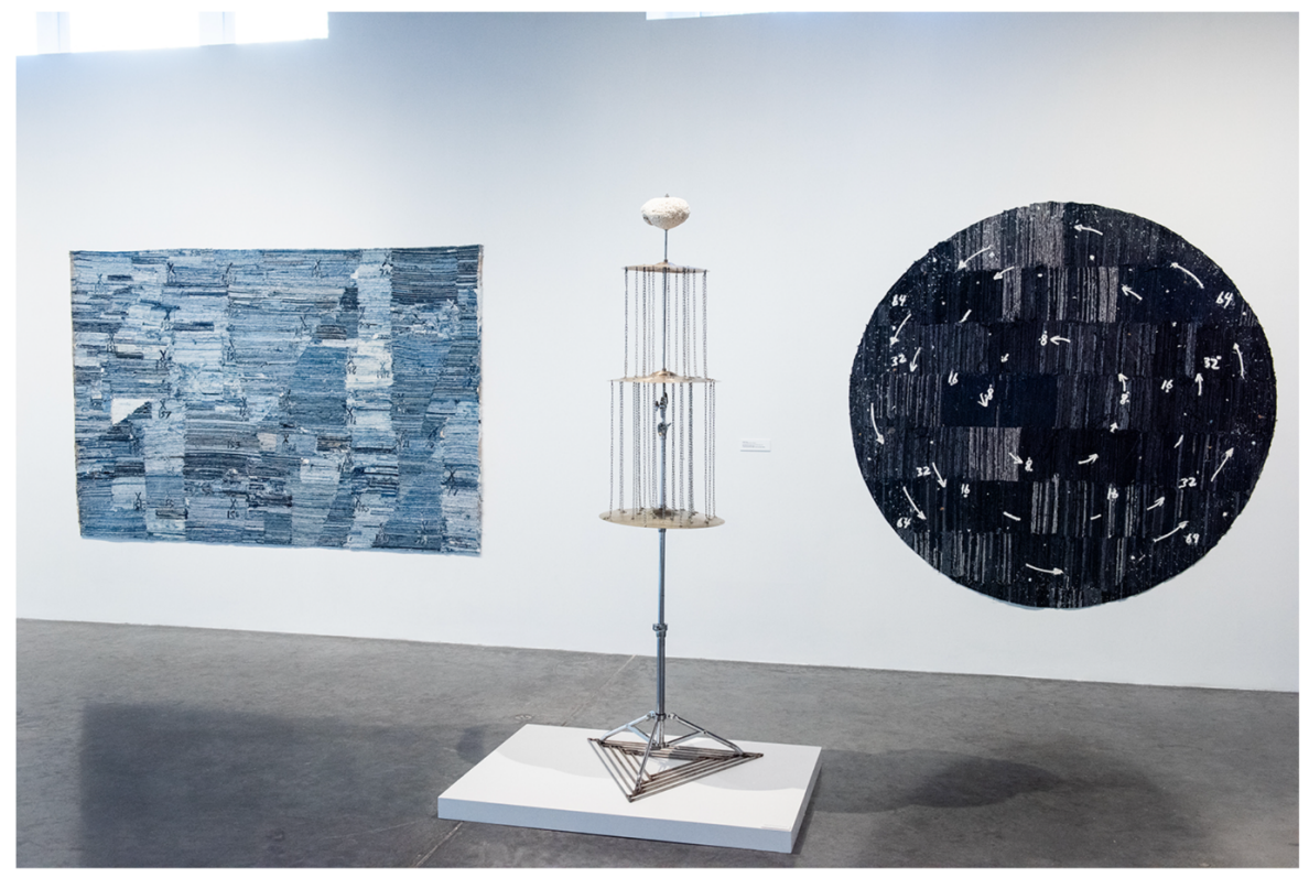
Installation with Cyrus's Bends to Gulf, 2021; Northern Carrabine Batterie, 2021; and Rampart, 2021.

As with previous iterations, cultural organizations as well as galleries, parks, theaters, and art centers were enlisted to present a variety of performances, installations, and art forms in conjunction with key institutions like the Contemporary Art Center (CAC), Newcomb Art Museum of Tulane University, New Orleans African American Museum (NOAAM), Ogden Museum of Southern Art, and the Historic New Orleans Collection.