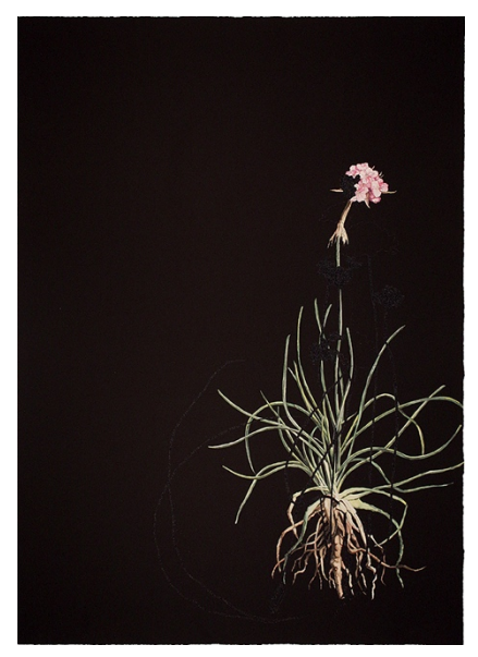
Katrina Moorhead, Dark Botanical , 2019 archival digital print with lithograph flocked with black salt and glitter on Somerset Satin 300gsm, 40 x 28.5 inches

Although the work frequently harks back to nature – mediated, hybrid and disjointed nature, but nature nevertheless – its affinity with the sea pink is primarily one of temperament. Like the sea pink's incongruous bursts of color jutting out over the Atlantic, Moorhead's sculptures sound notes of weathered but still lively defiance, even as they cling to the end of the earth.