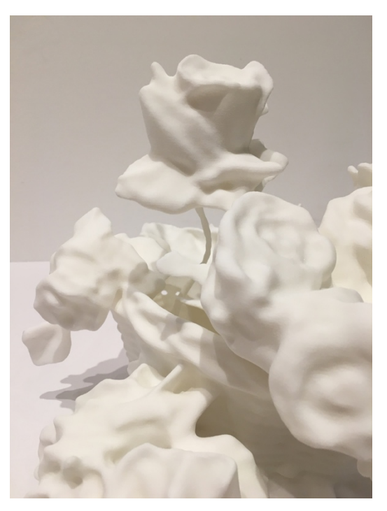
Katrina Moorhead, long playing record (detail), 2019 SLS 3D printed nylon, 8.42 x 12.17 x 12.27 in

As with Moorhead's image of the sea pink and indeed the sea pink itself, her sculptures claim more space than their size would first suggest. An undulating paper construction suspended on a wire unfolds diagonally across the north gallery, asserting itself with delicate resolve. An oak shelf rings the south gallery, changing height and depth as it goes, heedlessly cutting across doorways and encompassing the room in its orbit. Though never deeper than six inches, the shelf commands the room: it's a rolling, changeable horizon, a foundation, boundary and