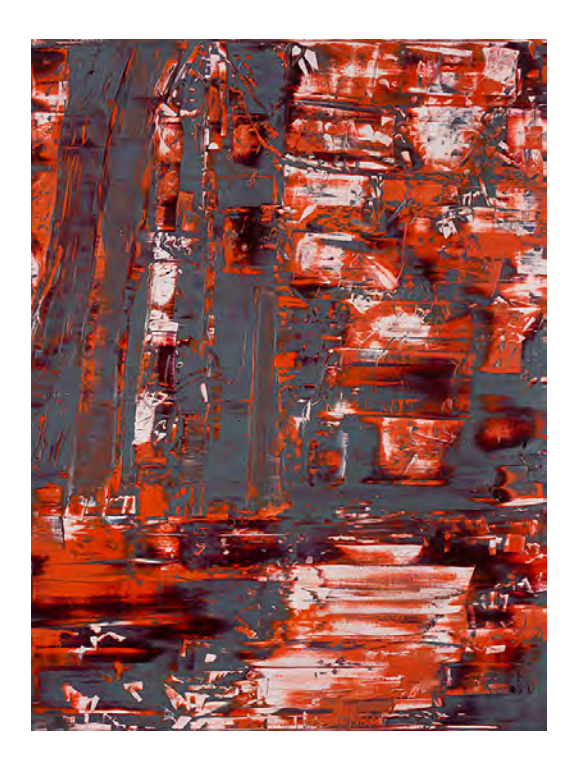
Gilad Efrat, Darwin Thinking Path , 2014 Oil on canvas, 73 x 53-1/2 inches; 185 x 136 cm

Gallery hours: Tues. – Sat., 11:00am – 6:00pm and by appointment