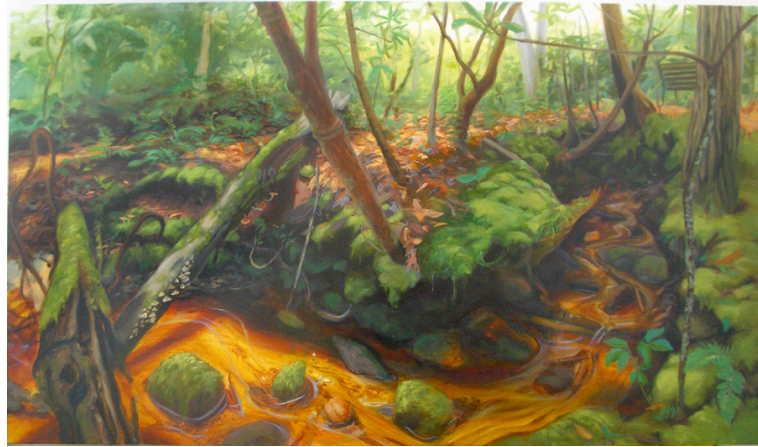
Kristin Musgnug, Hambidge Creek, 2006 oil on canvas, 42 x 72 inches

Opening Friday, January 12 6 – 8:30 pm Artist talks begin at 6:00pm