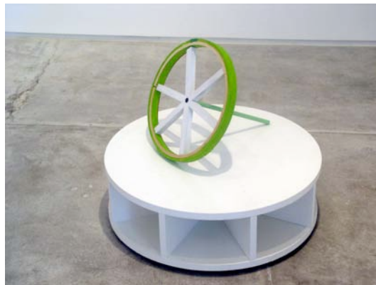
"Broken Spoke", 2004 Acrylic on wood 24" x 24" x 19"