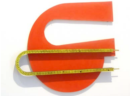
"Obscene Magnet", 2005 Acrylic on wood 15" x 17" x 1 1/2"

The north gallery installation comprises seven smaller individual sculptures. Obscene Magnet (left) and Urban Ivy , for example, consist of pieces of painted wood joined to create not only formal explorations akin to volumetric drawing, but also abstract associations to specific physical and literary subjects. The works are characterized by expedient construction methods and recycled elements; the rough-sawn edges are presented as equal in weight to pencil marks on the objects surfaces, and the shadow the object casts on the wall. Each contributes to the object's stature and presence; what at first seems offhand or casual begins to take on weight and importance.