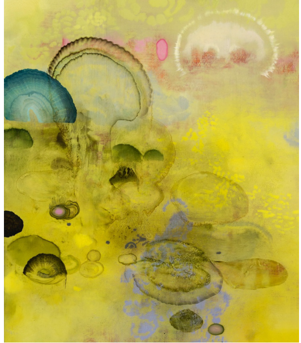
Darren Waterston, Partita no. 1 [detail] , 2024 oil on wood panel, 36 x 18 inches (91.4 x 45.7 cm)

Exhibition Walkthrough Saturday, September 14, 1:00pm