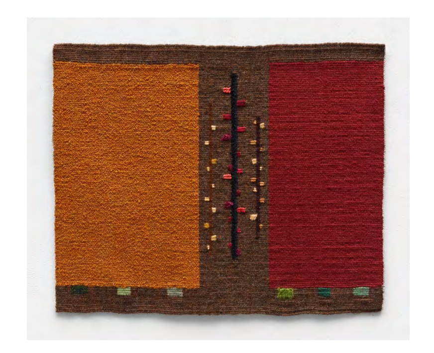
Jana Vander Lee, Summer: Flourish, 2021 linen warp; cotton, wool, acrylic, mohair, rayon weft 16\,^1/_8 x 20 in (41 x 50.8 cm)