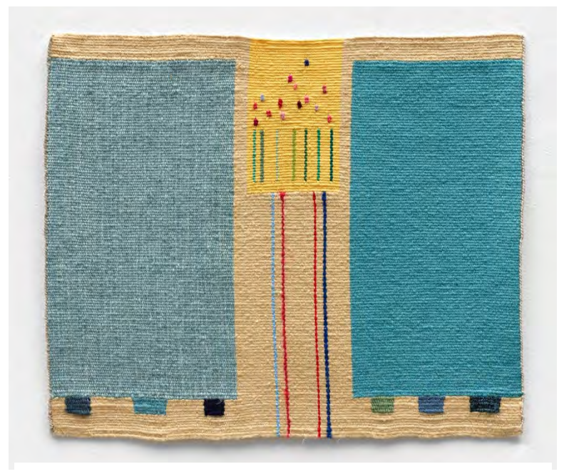
Jana Vander Lee, Spring: Hope , 2021 linen warp, rayon/nylon, wool/mohair, wool, acetate, cottolin, cotton, acrylic, mohair weft 18 <sup>3</sup>/<sub>4</sub> x 23 in (47.6 x 58.4 cm)