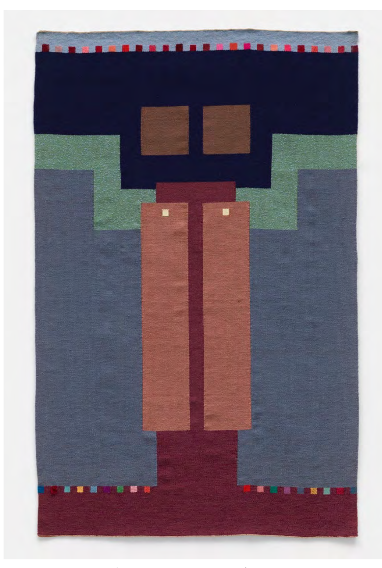
Jana Vander Lee, Gateway to the Dawn , 1987 linen, wool, rayon, acrylic, ramie, mohair 72 x 46 in (182.9 x 116.8 cm)

Vander Lee's tapestries appear at first to be formal engagements in fiber with geometric shapes and vibrant colors, but they also hold deeply personal meanings and iconographies that are meant to inspire and give hope amidst adversity. The artist's Calvinist background, ecumenical experiences, as well as an interest in sub-atomic physics all play a role in her exploration of the order and energies of the natural world.