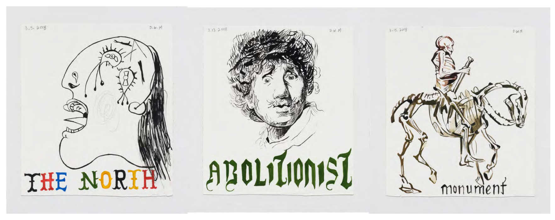
David McGee, THE NORTH, ABOLITIONIST, monument, all 2018 watercolor, graphite and ink on paper each 9.7/8 \times 8.7/8 in (25.1 x 22.5 cm)

The Tarot Cards series, comprising approximately 160 small works on paper, is rooted in a rich visual juxtaposition of image and text whose meaning is sometimes obvious while at others is more inconspicuous or obscure. However, in each of these works on paper, the reading of the image itself is governed by experience. For McGee, the artist's intent is immaterial; the viewer's background and experience are paramount. The Tarot Cards must be read or unpacked by the viewer who brings to the table their own biases, judgments, and experiences as they encounter these works and engage in what the artist calls a process of "transformational looking." As McGee notes, these evocative works aim to tell the truth about images and how they work upon or impact the viewer who engages with them.