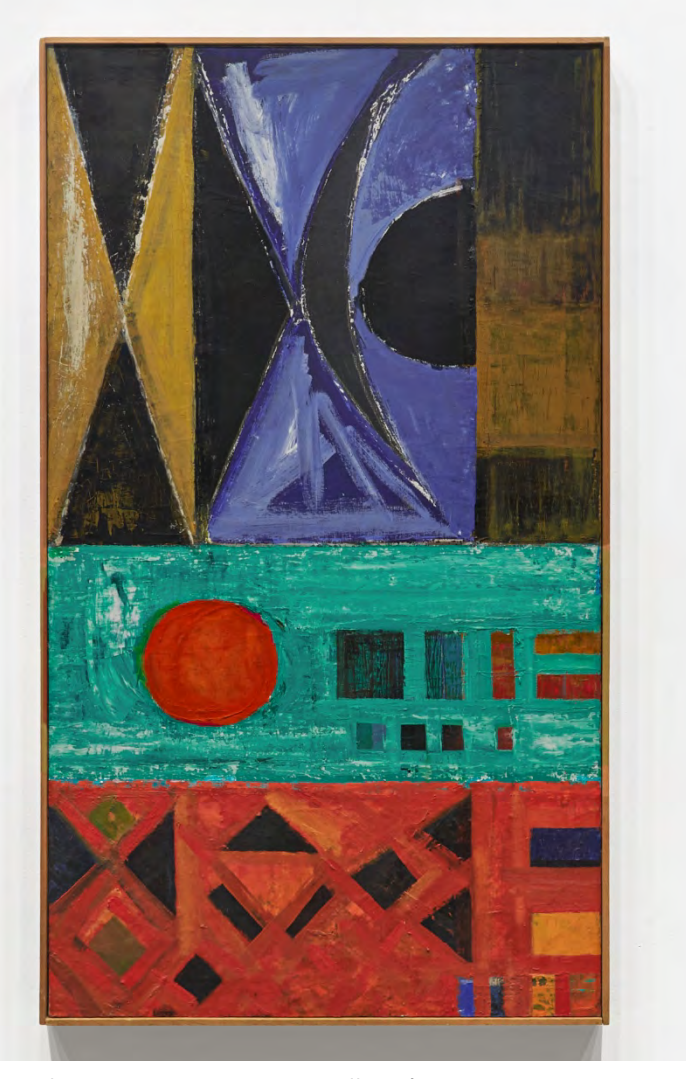
Dorothy Antoinette (Toni) LaSelle, Theme 1-C , 1952 oil on canvas, vintage frame , 44 \times 25 in (111.8 × 63.5 cm) 44^{1}/_{2} \times 25^{3}/_{4} in (113 × 65.4 cm) framed

Not unheralded in her lifetime, she had solo exhibitions at the Dallas Museum of Art (1948) and the Fort Worth Art Center (1959). She was recently included in the exhibition "Texas Artists: Women of Abstraction" at the Art Museum of South Texas in Corpus Christi in 2022. Our Expo presentation will include a dynamic 1952 painting along with a selection of works on paper from the 1950s and 1970s.