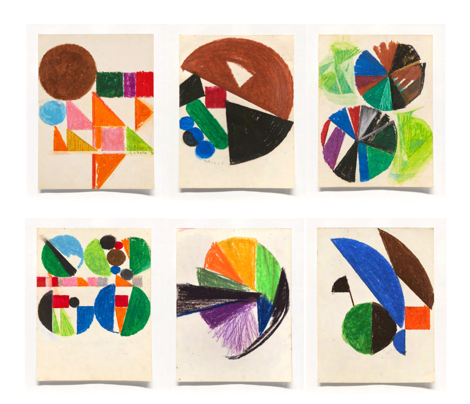
Toni LaSelle, Untitled , 1975, 6 Cray-Pas (oil pastel) on paper 12 \times 9 in (30.5 \times 22.9 \text{ cm}) each, 16^{1}/_{2} \times 13^{1}/_{2} \times 15^{1}/_{8} in (41.9 \times 34.3 \times 4.1 \text{ cm}) each framed