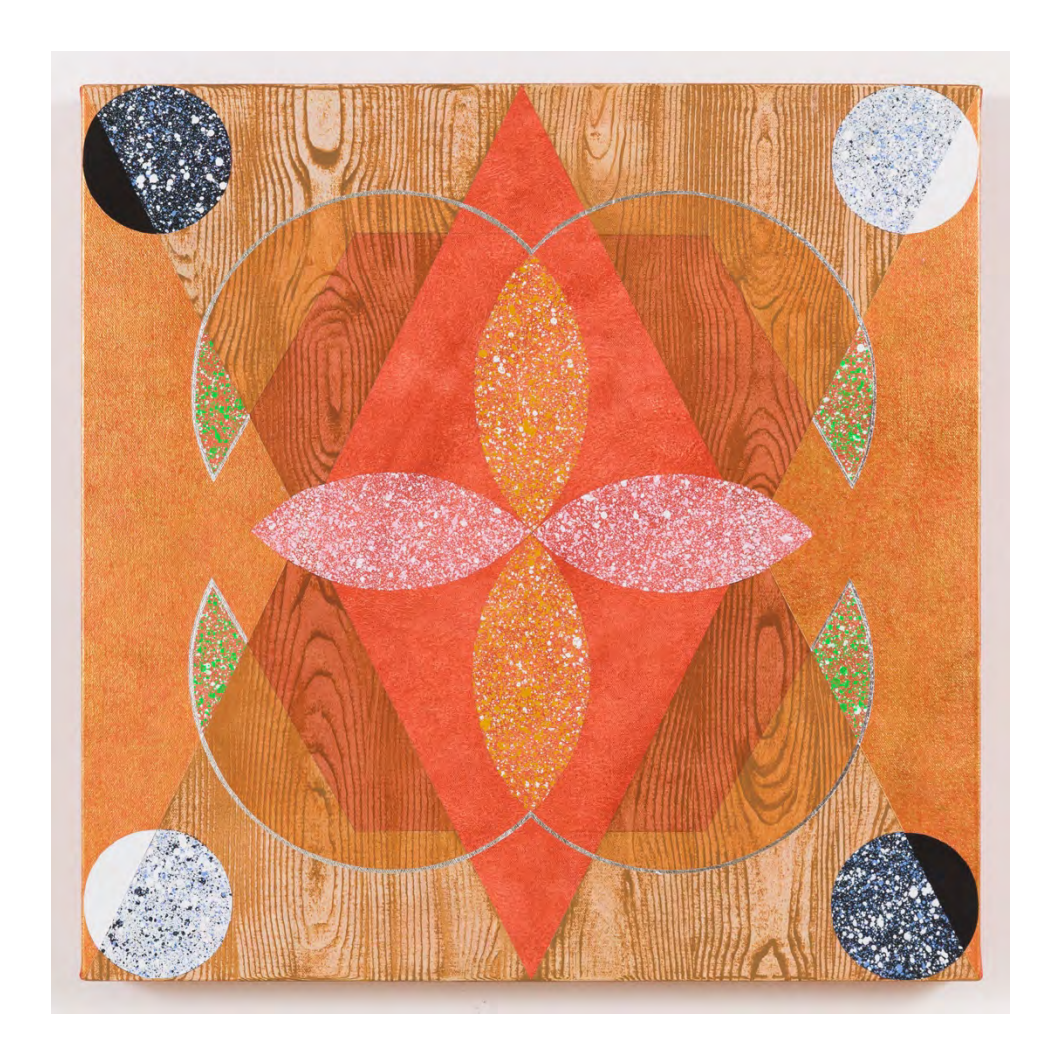
Emily Joyce, Turk's Cap Lily , 2022 Flashe vinyl paint, acrylic, and metal leaf on canvas over panel 18 \times 18 \times 1^{1}/_{2} in (45.7 \times 45.7 \times 3.8 \text{ cm})