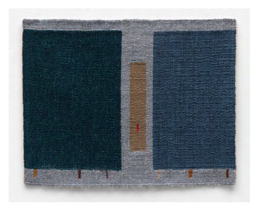
Jana Vander Lee, Winter: Duration , 2021 linen warp; wool, rayon, mohair, viscose, synthetic weft 18^{1}/_{4} \times 23^{1}/_{4} in (46.4 \times 59.1 \text{ cm})

"In each year's cycle of seasons, there is a break, a transition between them, a passage that is different each year, and in that in-between period, energies emerge that will define how the next season will be unique to that year.